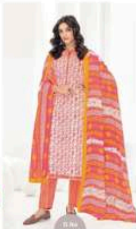
D. No. 5209