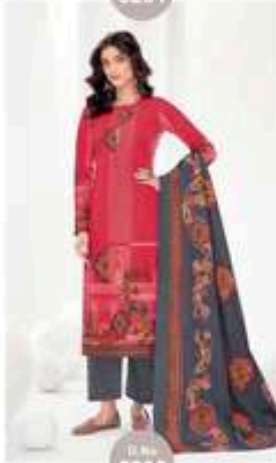
D. No. 5205