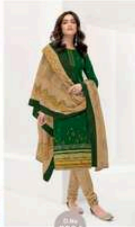
D. No. 5204