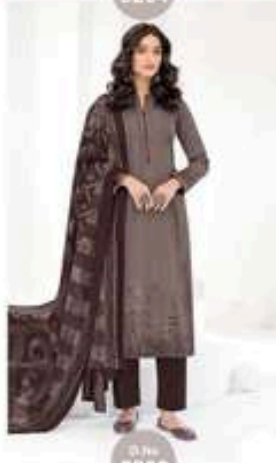
D. No. 5206