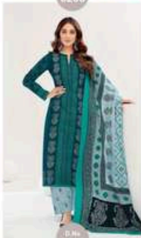
D. No. 5207