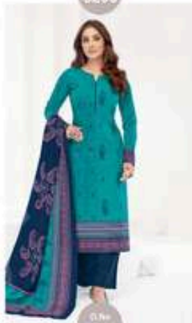
D. No. 5210