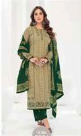
D. No. 5201