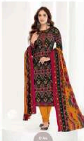
D. No. 5208