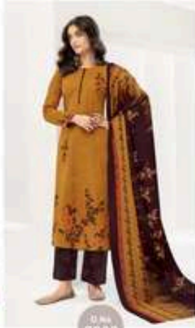
D. No. 5203