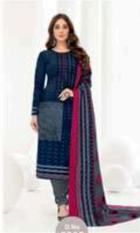
D. No. 5202