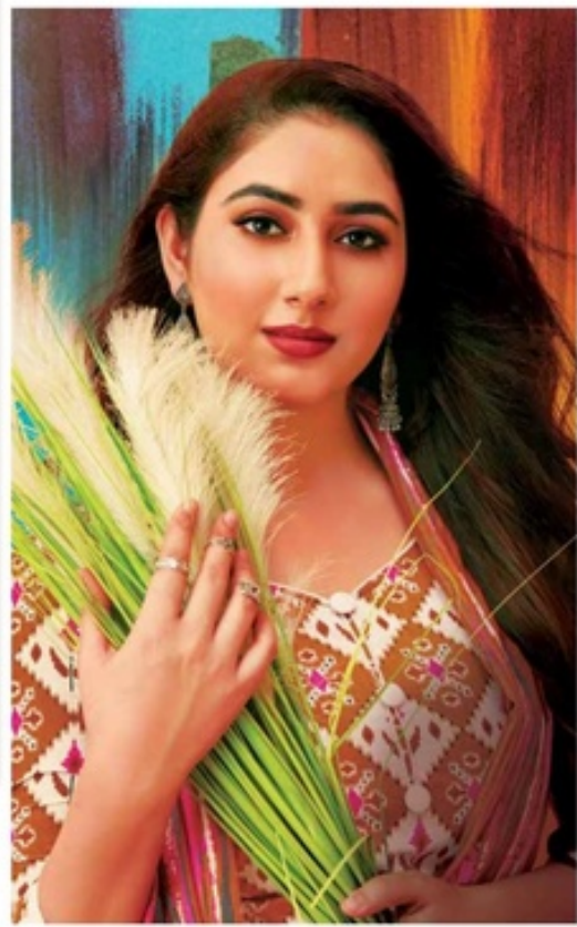
CHIEF GUEST SPECIAL CHUNDRI PICHKARI