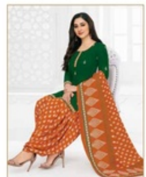
1056 Premium Collection

Pranjul ® Priyanka ® Vol. 10 (Patiyala Special)