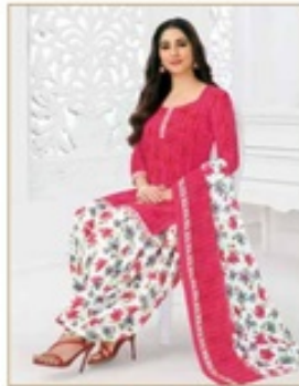
1055 Premium Collection