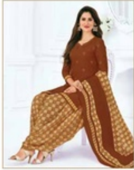
1049 Premium Collection