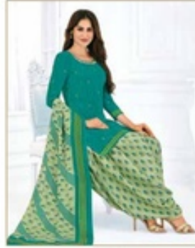
1050 Premium Collection