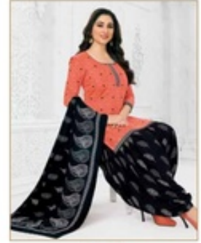
1052 Premium Collection