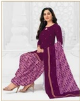
1053 Premium Collection