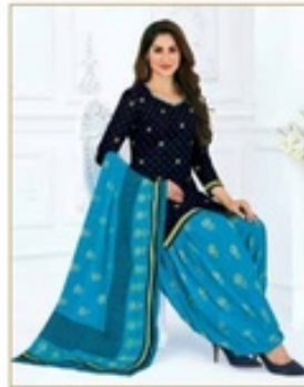
1054 Premium Collection