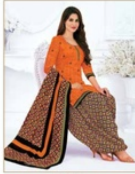
1051 Premium Collection