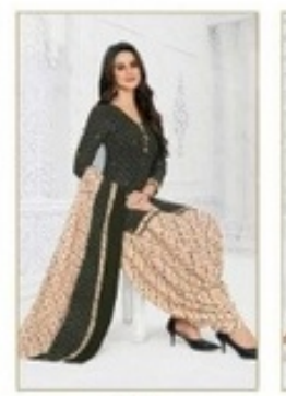
941 Premium Collection