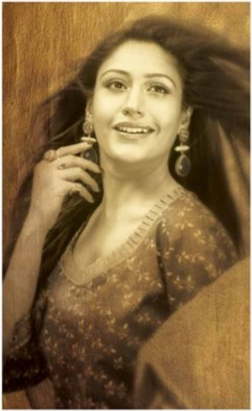
MISS INDIA MAHARANI

Our Specialities also in Kurtis, Salwar Suits, Fabrics & Readymade