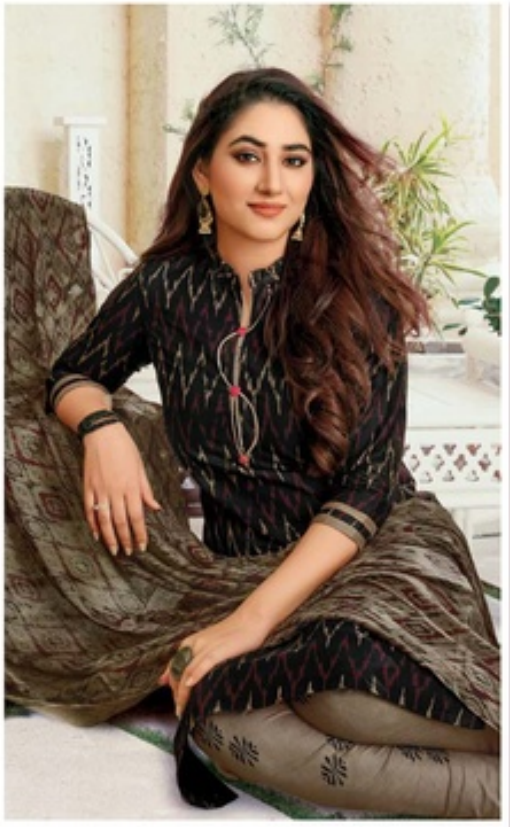
MISS INDIA MAHARANI

Our Specialities also in Kurtis, Salwar Suits, Fabrics & Readymade