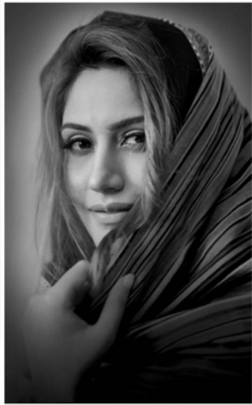
CHIEF GUEST SPECIAL CHUNDRI PICHKARI