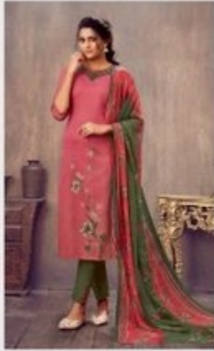
d.no : 9002