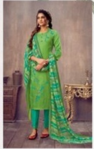
d.no : 9004