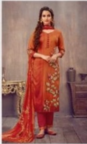
d.no : 9005