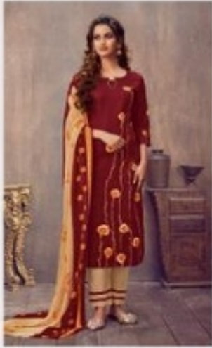
d.no : 9001