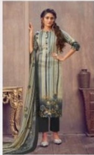
d.no : 9006