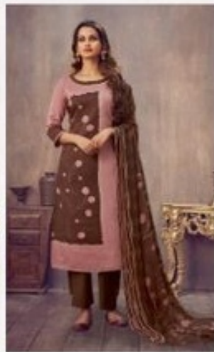
d.no : 9009