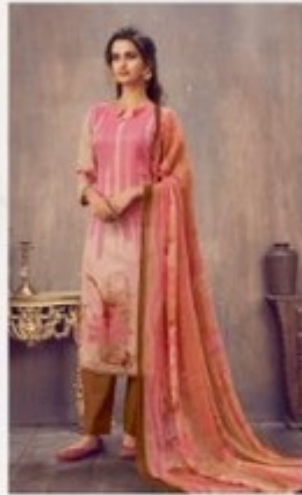
d.no : 9007