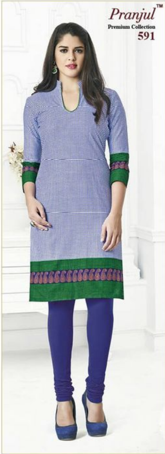
Pranjul TM Premium Collection 591