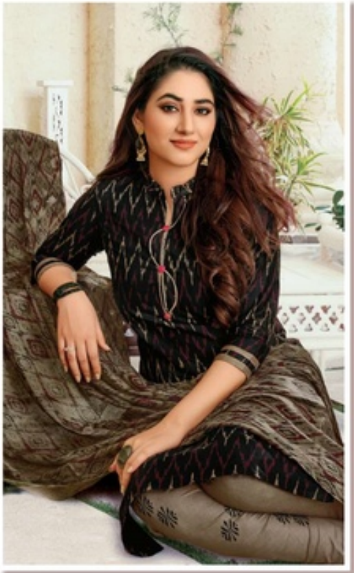
MISS INDIA MAHARANI

Our Specialities also in Kurtis, Salwar Suits, Fabrics & Readymade