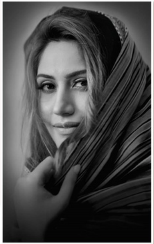
CHIEF GUEST SPECIAL CHUNDRI PICHKARI