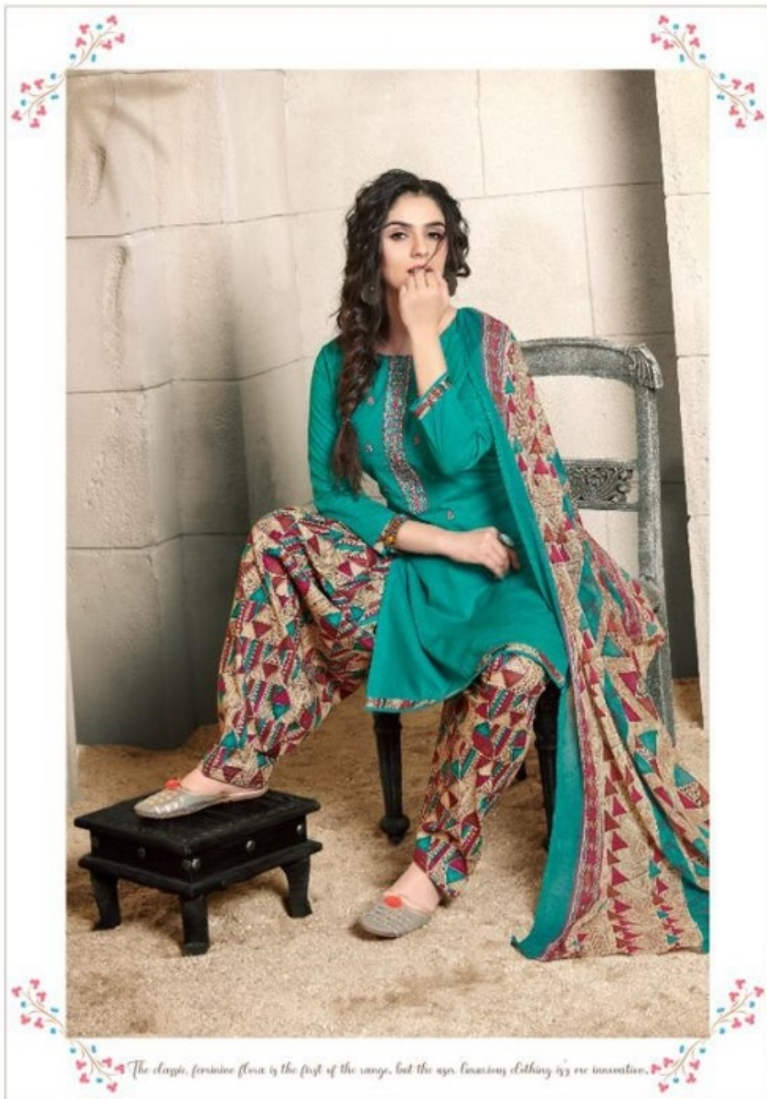
The classic, feminine flora is the first of the range, but the user luxurious clothing is, are innovation.