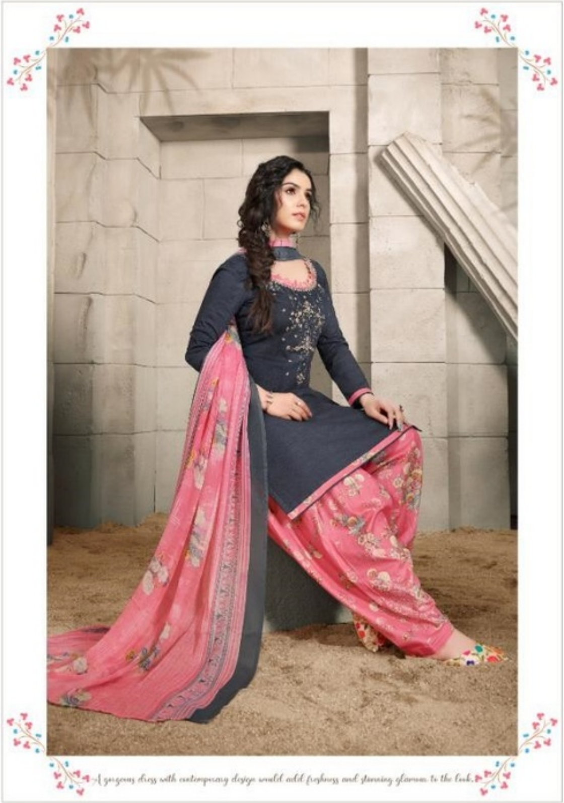
A gorgeous dress with contemporary design would add freshness and stunning glamour to the look.