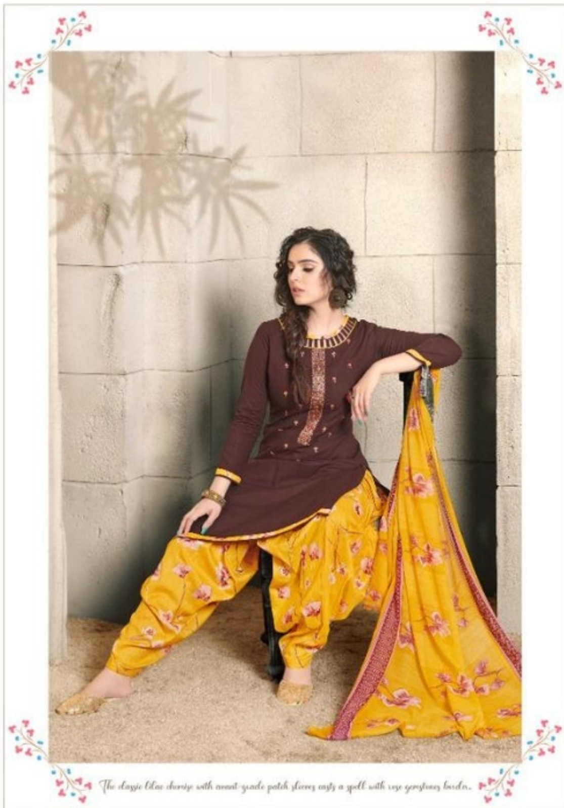
The classic blue kurta with avant-garde patch sleeves casts a spell with rose gemstones border.