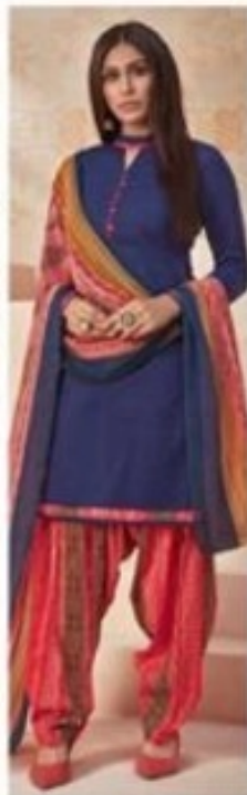
D / 17008