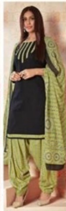
D / 17010