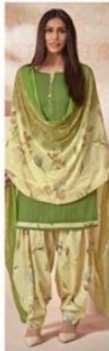
D / 17004