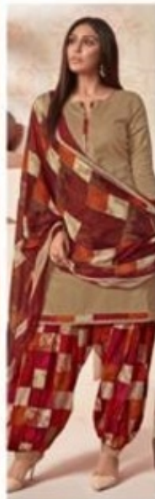
D / 17009