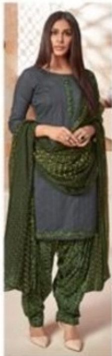
D / 17006