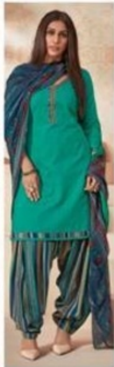
D / 17002