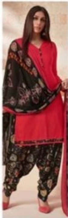
D / 17001