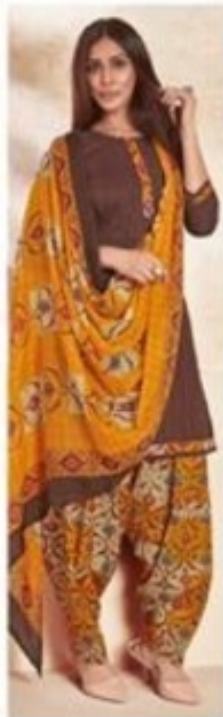
D / 17003