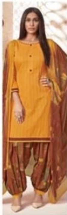
D / 17007