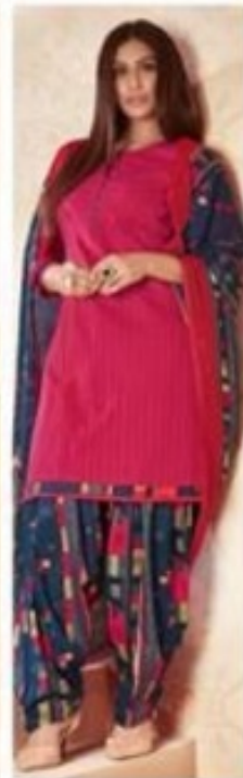
D / 17005