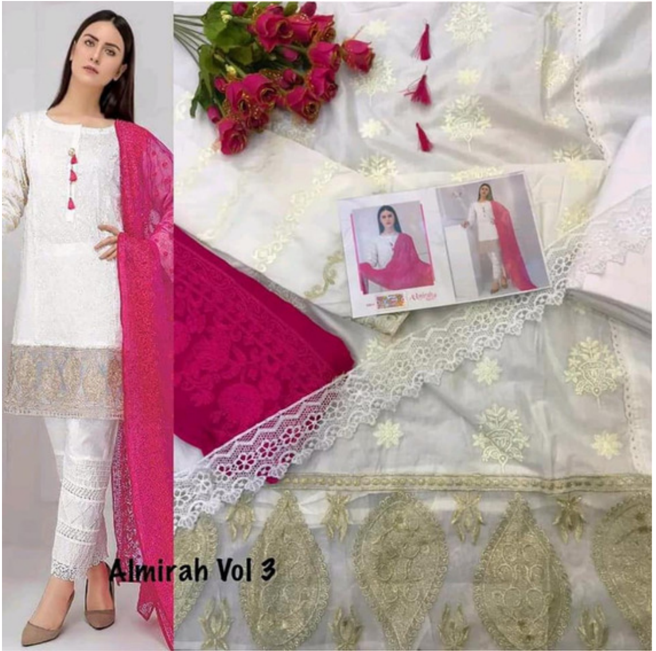
Almirah Vol 3