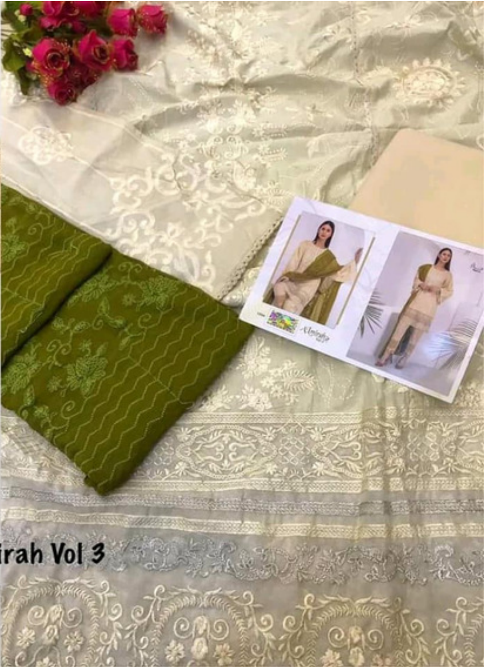
Almirah Vol 3