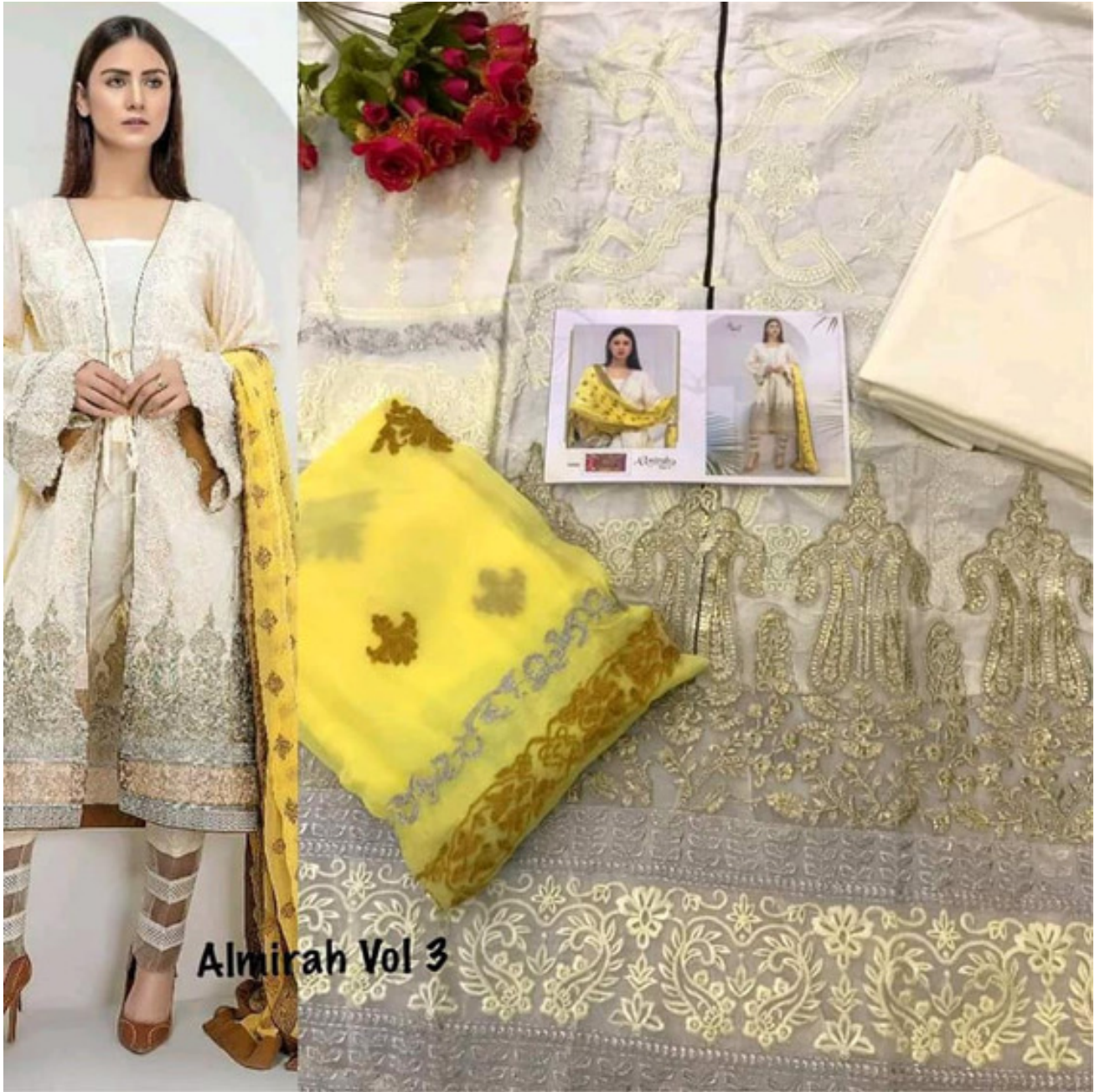
Almirah Vol 3