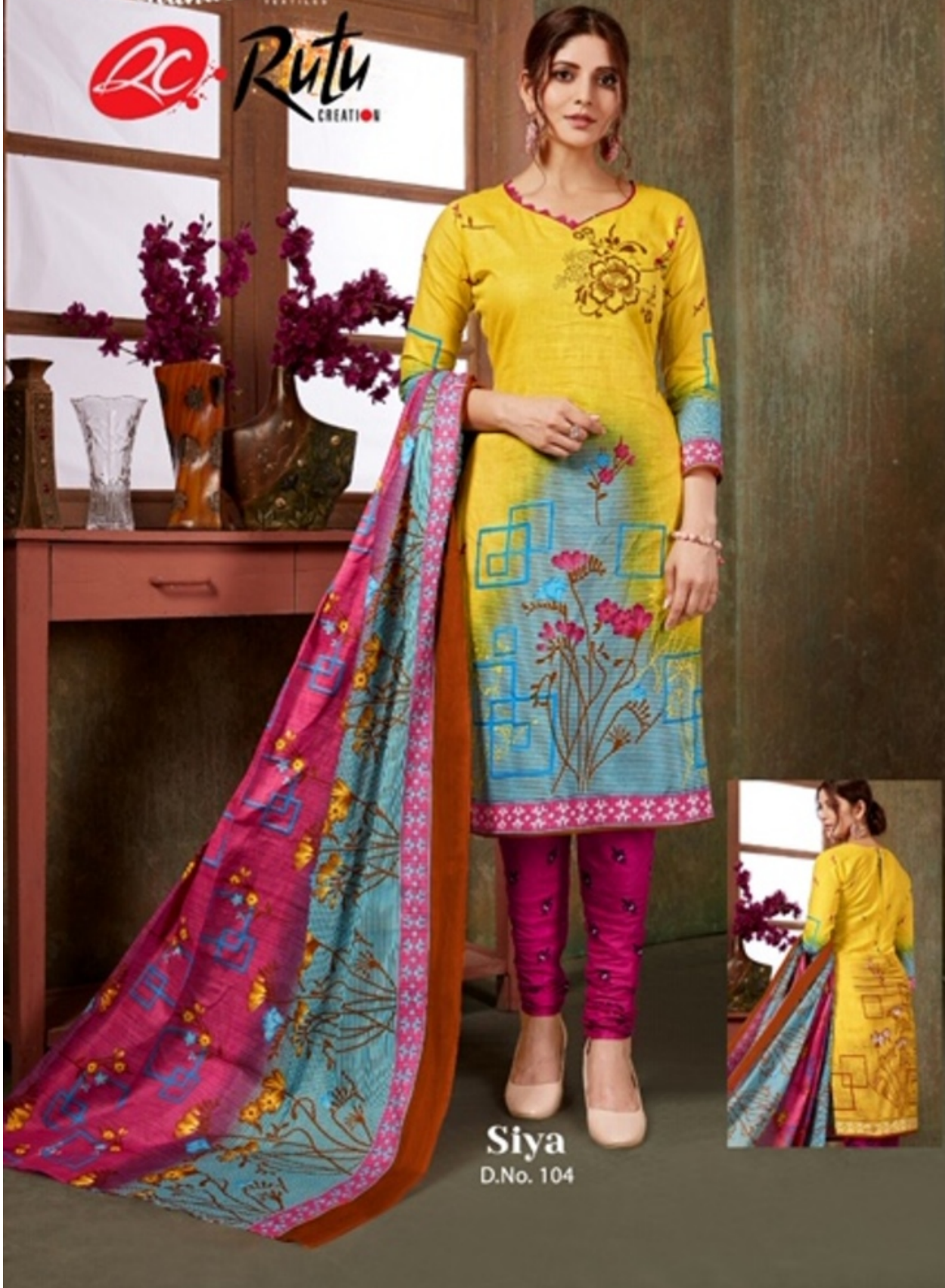
Siya D.No. 104