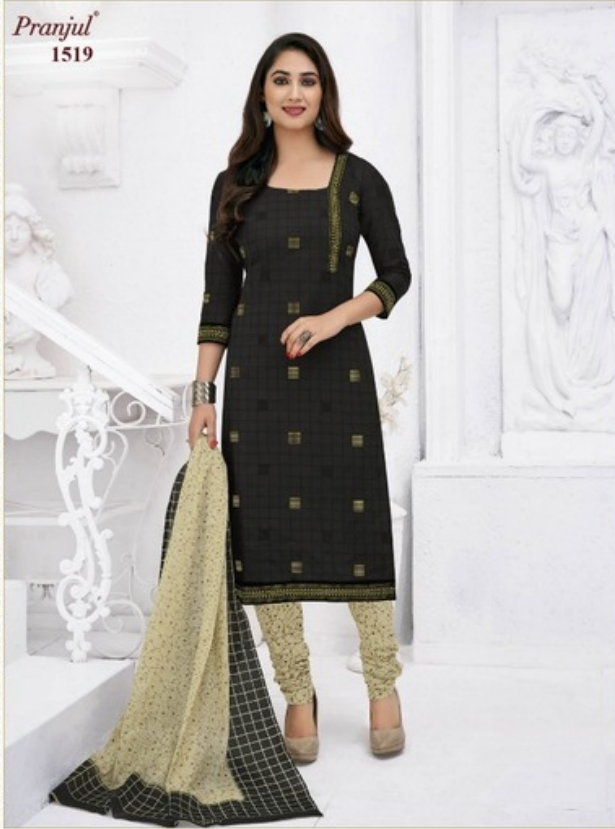
Pranjul ® 1519