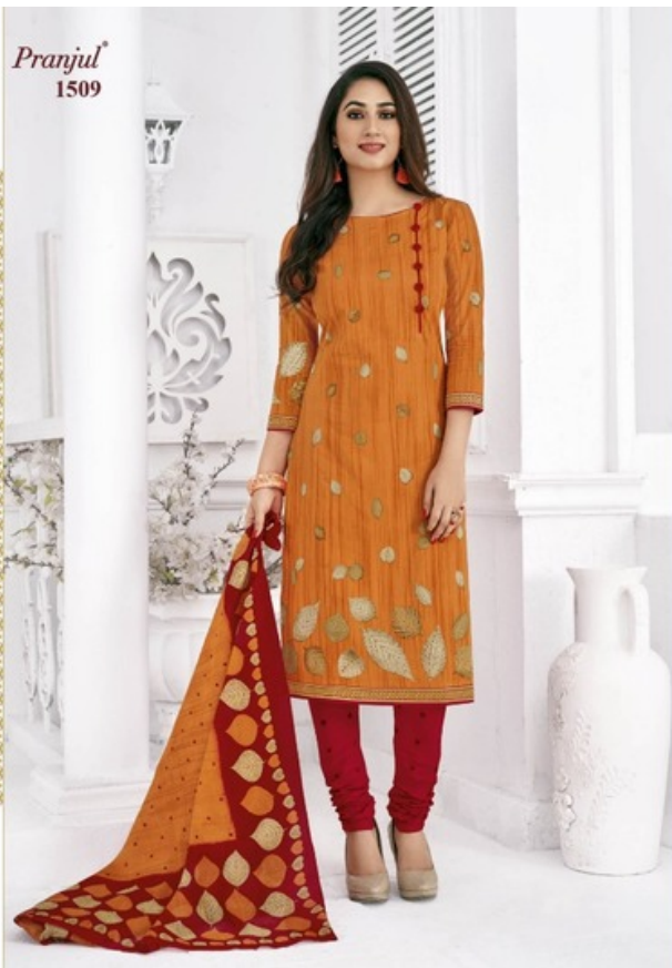
Pranjul ® 1509