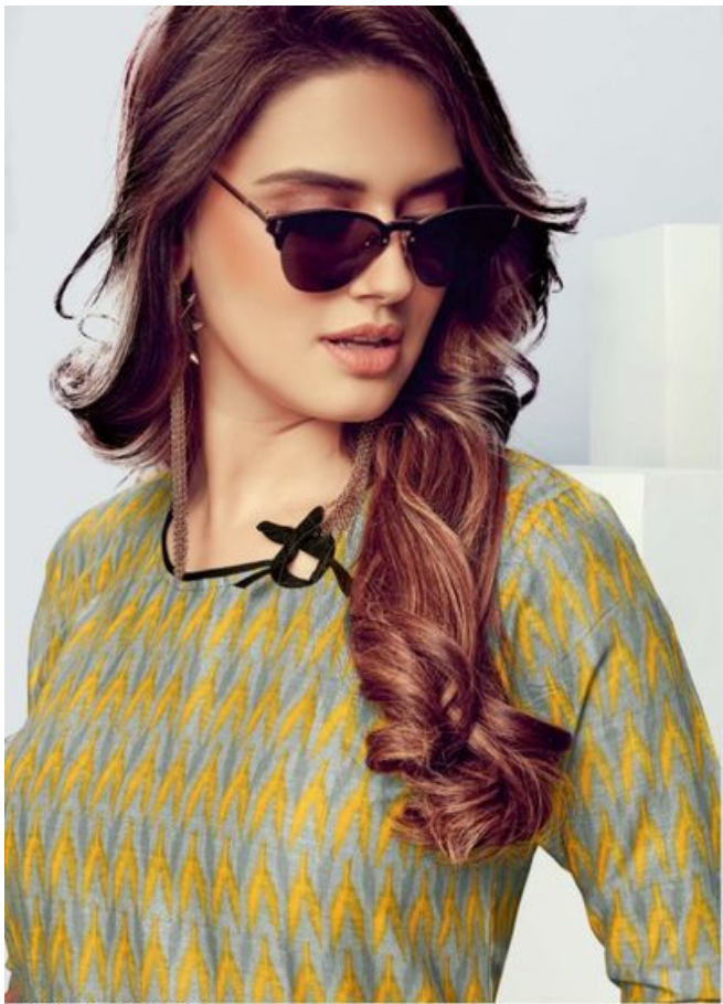
SURYAJYOTI PEHEL VOL 4