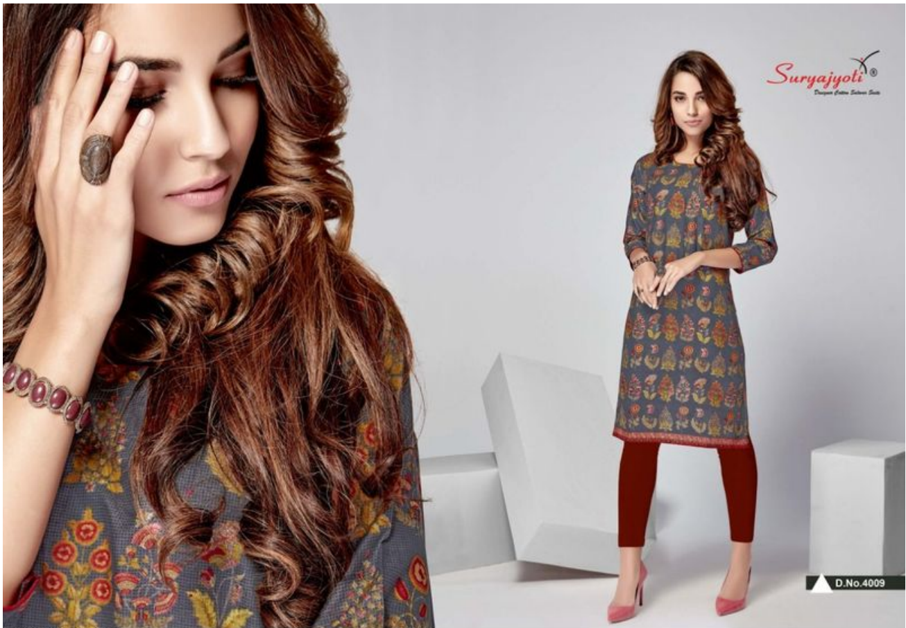
SURYAJYOTI PEHEL VOL 4